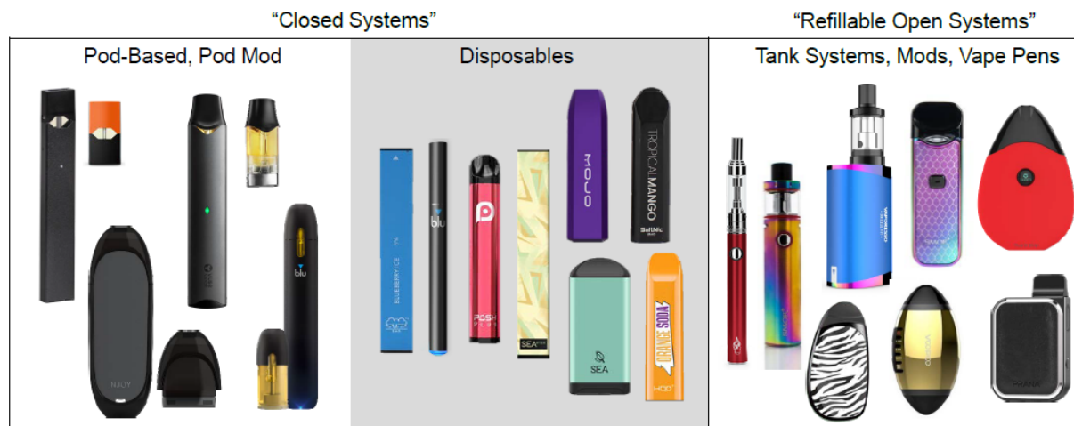
Sample of e-cigarette products. Images are not to scale.

The term “electronic cigarettes” covers a wide variety of products now on the market, from those that look like cigarettes, pens or USB drives to somewhat larger products like “personal vaporizers” and “tank systems.”* Instead of burning tobacco, e-cigarettes most often use a battery-powered coil to turn a liquid solution into an aerosol that is inhaled by the user. There are a wide range of reusable e-cigarettes and “pods,” which enable users to replace a nicotine-containing cartridge or refill a tank with a liquid solution, and there are disposable e-cigarettes, which cannot be refilled. There are also “mods,” which are units that users assemble themselves from separate component parts, to allow variation in battery power, style, and size. 4 A study found more than 430 brands of e-cigarettes available for purchase online in 2017. 5 As of December 27, 2020, pre-filled cartridges for pods made up 65.6% of sales in traditional retail outlets, † while disposable e-cigarettes made up 34.4%, more than doubling their market share since January 2020. 6